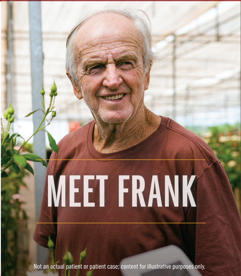
Not an actual patient or patient case; content for illustrative purposes only.

NAME Frank AGE 74 OCCUPATION Retired corporate professional LIFESTYLE I enjoy gardening and reading MARITAL STATUS Married with 3 children SUPPORT My oldest son is my caregiver